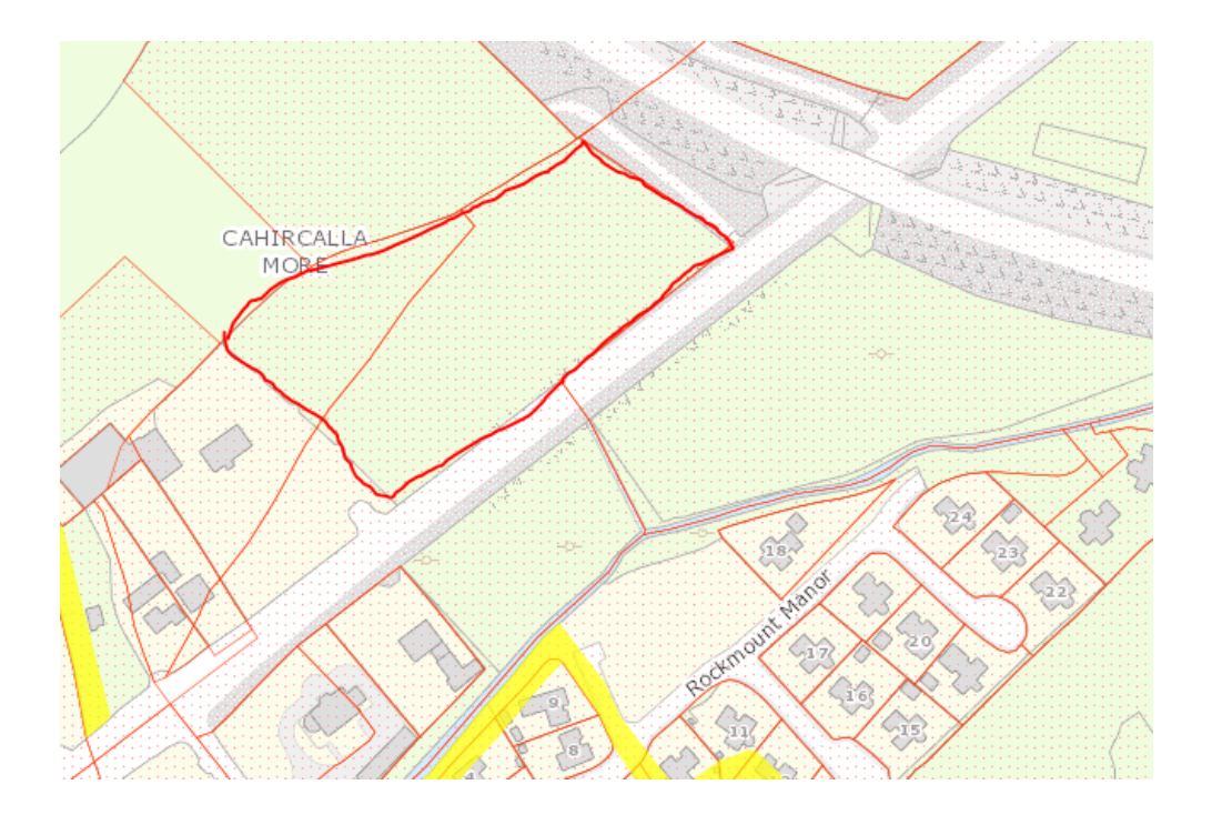
Figure 1 – Site Location Map – Subject Site outlined in Red